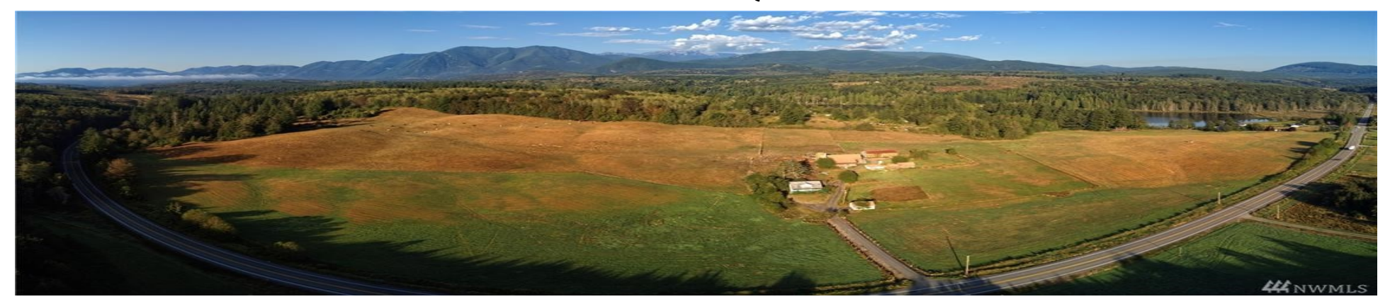
Jefferson LandWorks Collaborative seeks qualified farmer to purchase historic Kawamoto Farm and house for active agricultural use

The historic Japanese-American Kawamoto Farm in Quilcene's Leland Valley will be for sale at an affordable agricultural price. The farm is located next to Lake Leland, alongside Highway 101, with moderately-sloped rolling topography.